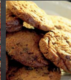
Loaf Chocolate Chunk Cookies ..... $15 x 20