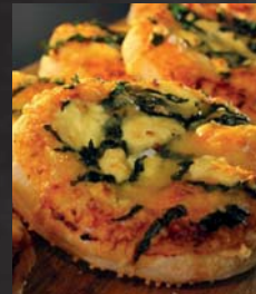
Spinach & Feta Pizza Breads ..... $22 x 10