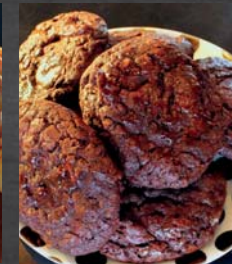
Mrs Higgins Double Chocolate Cookies ..... $15 x 20