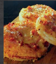
Ham & Cheese Pizza Breads ..... $22 x 10