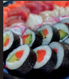
Chicken Teriyaki / Avocado & Salmon Sushi, Pickled Ginger, Wasabi & Soy ..... $22 x 20