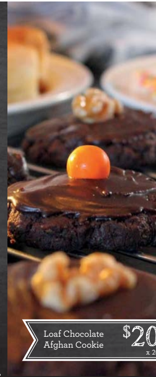
Loaf Chocolate Afghan Cookie ..... $20 x 20